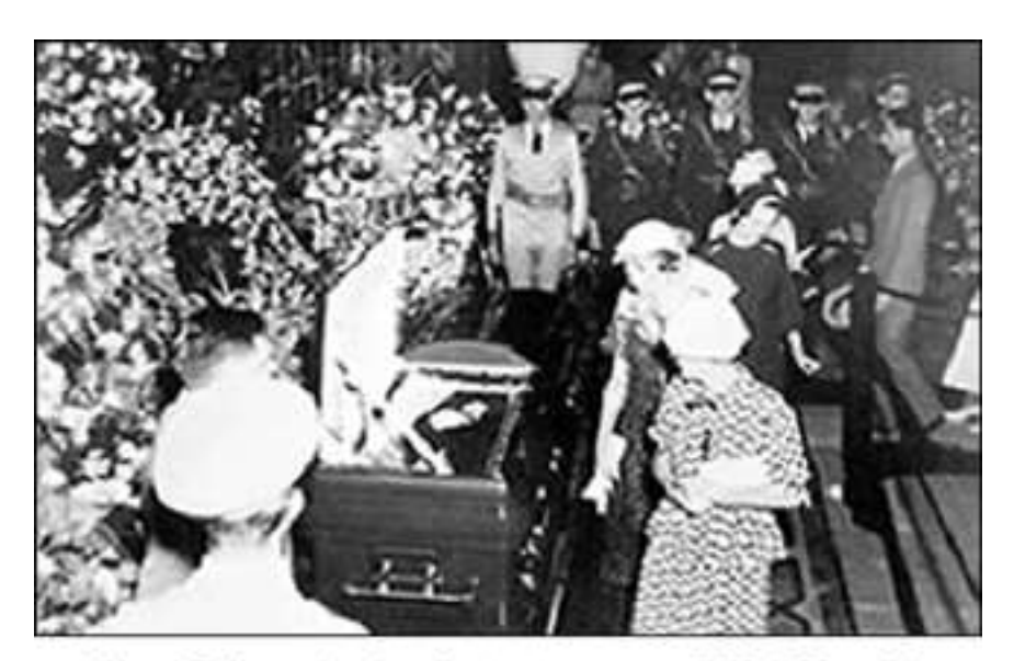
Huey P. Long laying instate as over 300,000 paid their respect at the Louisiana State Capitol Building which was constructed while he was the governor.