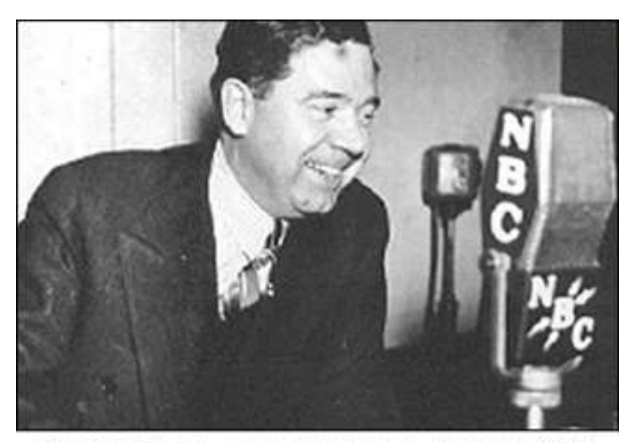
Broadcasting to a record braking audience in 1934